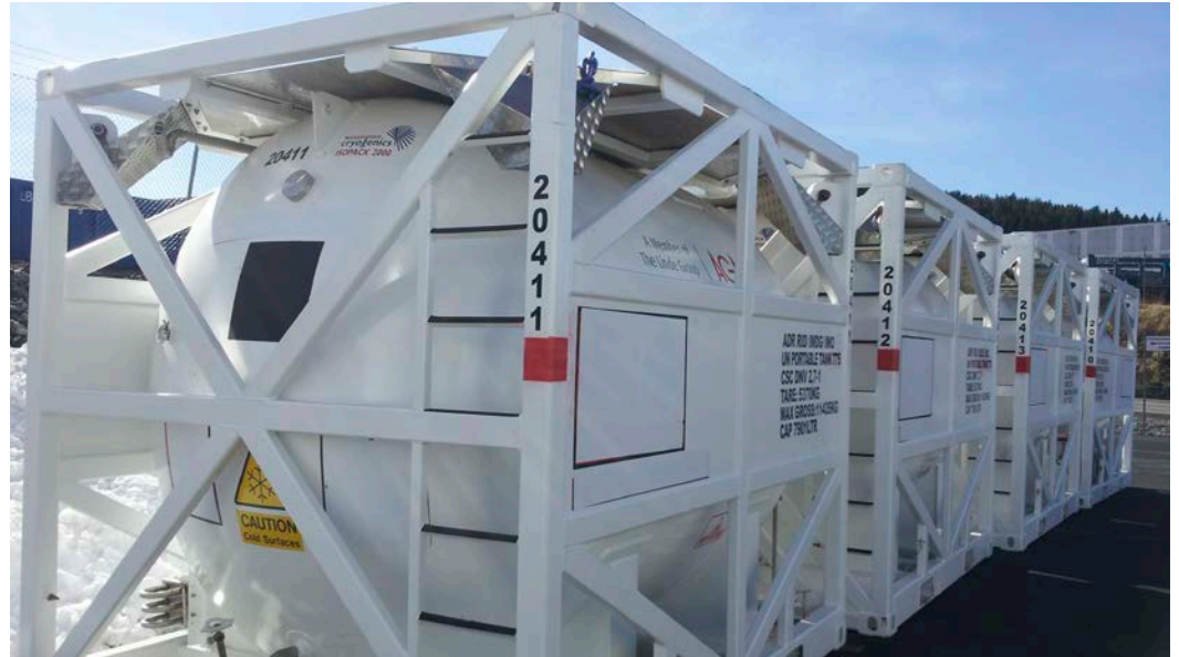
Offshore high pressure cryo tanks.