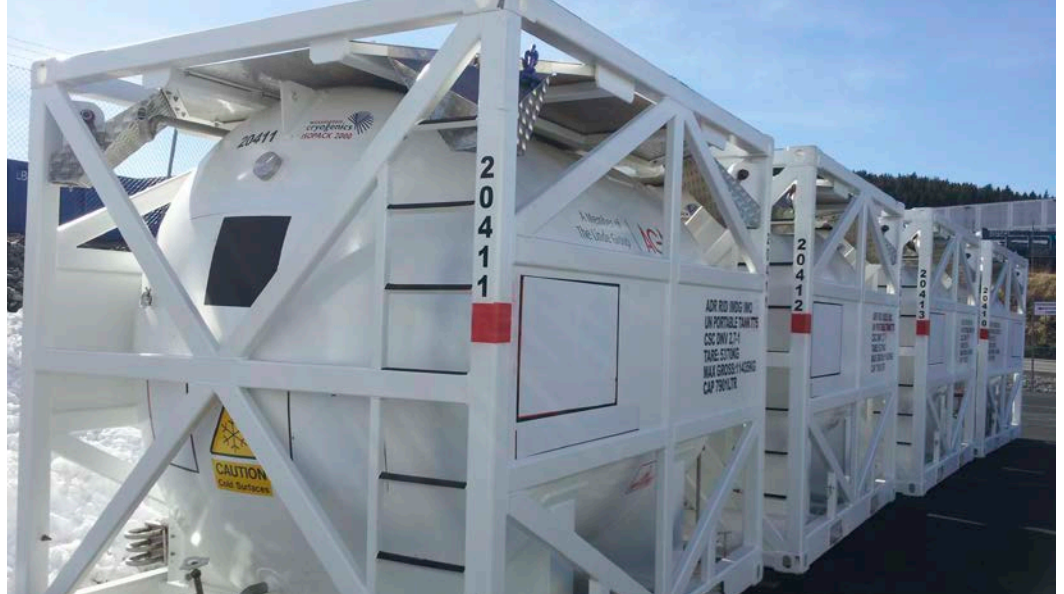
Offshore cryo tanks 6 Bar.